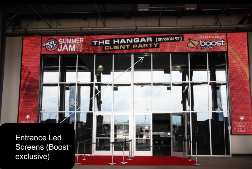
Entrance Led Screens (Boost exclusive)