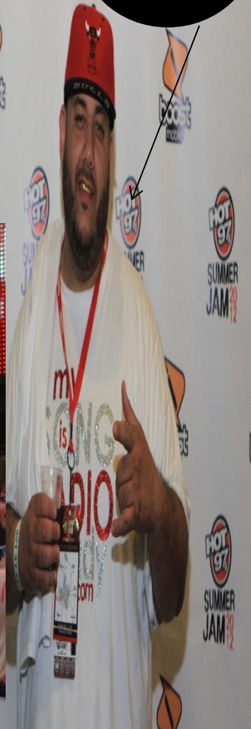
Summer Jam/Boost Branded Step and Repeat