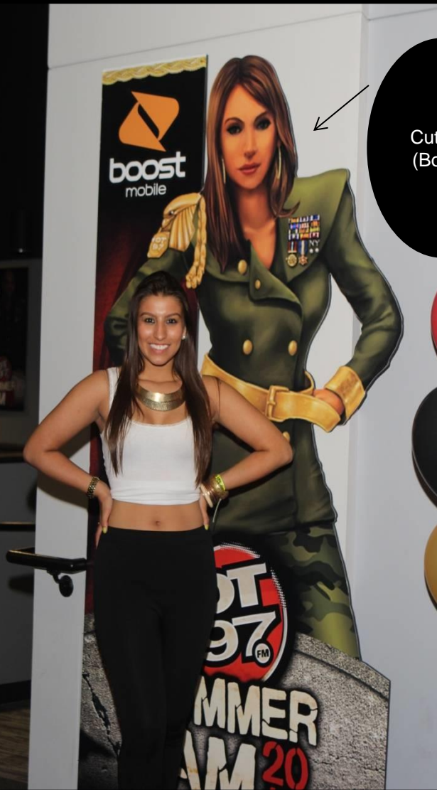
Cut Out (Boost)