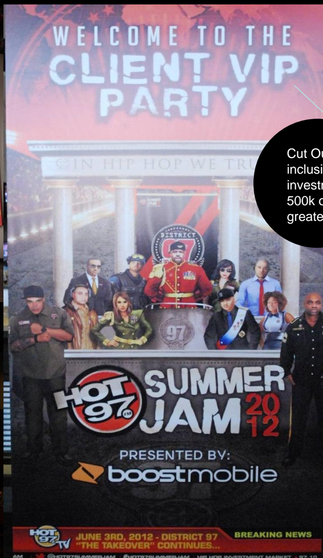
Cut Out inclusion for investments 500k or greater