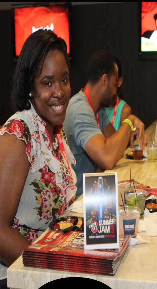
Table tops (VIP party sponsor opportunity)