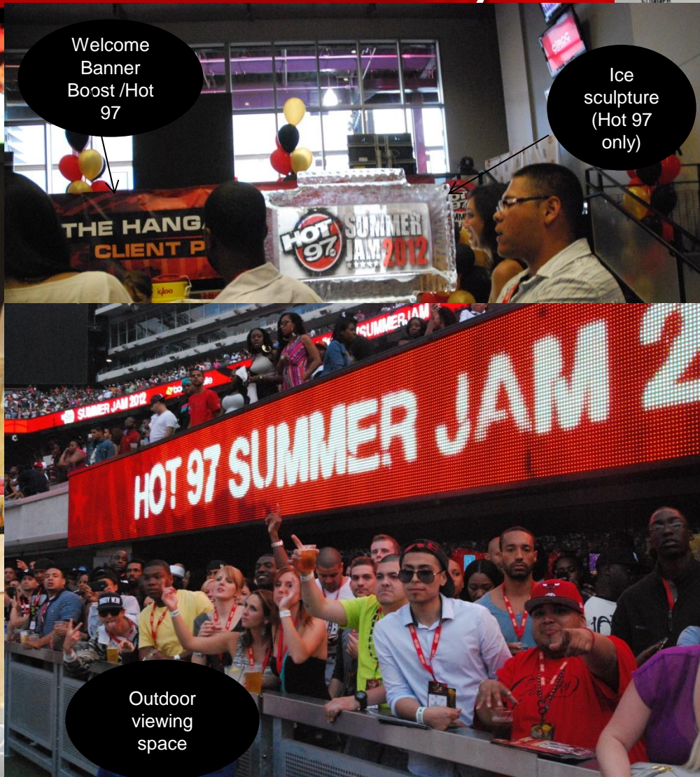
Welcome Banner Boost /Hot 97